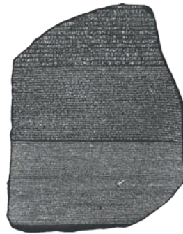
The Rosetta Stone (currently in the British Museum, London)